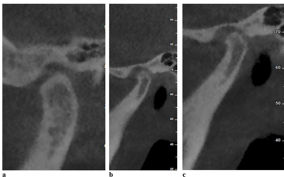
Figure 1a: Flattening of the articular surface, b: Irregular TMJ space, Loss of continuity of cortex of the condyle, c: Sclerosis of cortical bone