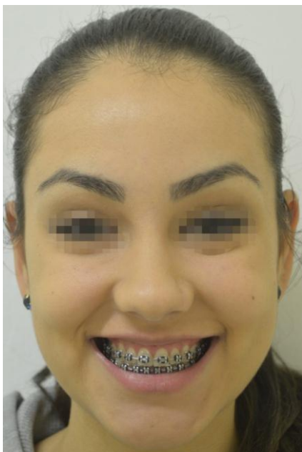
Figure 7: Post-surgical (30 days): persistence of gummy smile complaint.