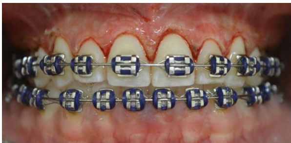
Figure 5: Post-surgical: upper right side

There was no need of the use of surgical cement, given that the process of the wound occurs by secondary intention. The patient reported no complaints or complications after surgery.