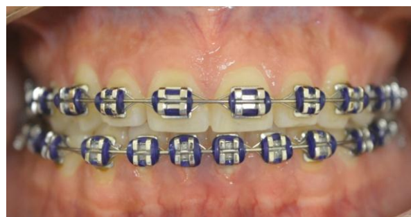
Figure 3: Initial clinical appearance showing an anatomical discrepancy between the lengths of teeth

owing gingival exposure greater than 3mm (Figure 3).