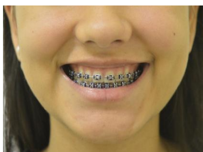
Figure 2: Gummy smile: closer view

The patient presented a good general health and absence of active periodontal disease. Clinically, the patient had short clinical crowns and a gummy smile sh-