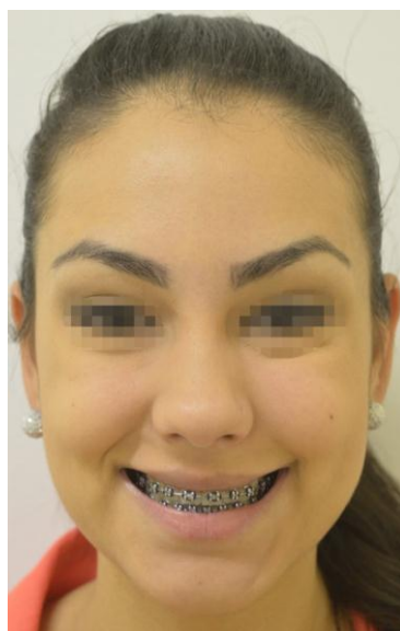
Figure 9: Aesthetic results after 10 days of application of botulinum toxin.

After 10 days, the patient was examined. She presented a uniform dehiscence of the upper lip and reduction and attenuation of gummy smile (Figures 9 and 10). Side effects or complaints were not reported.