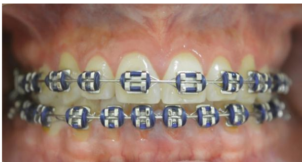
Figure 6: Post-surgical (30 days): observed satisfactory tissue repair

After 30 days, at the subsequent consultation, satisfactory tissue repair was observed (Figure 6), and no changes or complaints were reported by the patient. However, the persistence of complaint of gummy smile was reported by the patient (Figures 7 and 8).