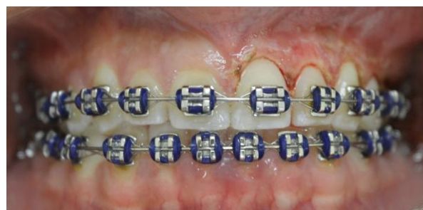
Figure 4: Post-surgical: upper left side

The primary treatment plan proposed was a combined orthodontic-surgical approach by mean of LeFort I osteotomy in order to affect the maxilla and reduce the gingival exposure. The patient refused the surgical approach. A second treatment plan was developed and proposed consisting of a preliminary gingival surgery (gingivectomy) followed by injection of botulinum toxin type A. The patient was informed about the recurrence of gummy smile after 6 months of application because of temporary results of the botulinum toxin. The patient read and signed a written consent form prior to treatment. Under local infiltrative anesthesia, bleeding points were determined with the aid of a millimetered- probe and the union of these points were performed with the electrocautery. [2] The length of the teeth was increased, characterizing the dental zenith. Subsequently, the scraping was performed, resembling the technique of external bevel, in order to enhance issue healing (Figures 4 and 5).