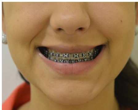
Figure 10: Aesthetic results: closer view