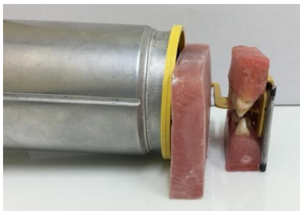
Figure 2: Digital bitewing radiograph obtained by photo stimuable phosphor plate.

The x-ray unit used was a Planmeca Intra (Helsinki, Finland) with a focal spot size of 0.7mm, 2-mm Al filtration, and a constant nominal tube potential selectable at either 60 or 70 KVP. The teeth were radiographed with their long axes perpendicular to the central ray and the operating distance between PPs and focus was 35.0 cm. Visibility of the pulpal root canal, dentine, and enamel was used as an indication of optimal image quality for all images (Figure 2). [1, 26-27]