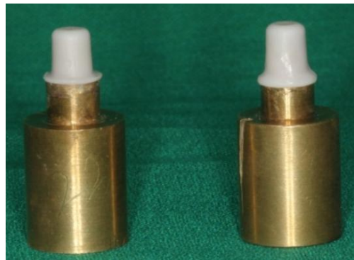
Figure 3: Zirconia copings placed on master dies

The null hypothesis of this study was rejected because the margin design was found to have significantly affected the fracture strength of zirconia copings, and copings with 135° shoulder margin were significantly more resistant than those with 90° shoulder.