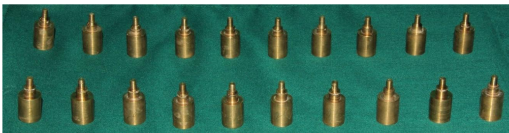
Figure 1: Master dies

In this in vitro study, 20 standard brass dies were designed and prepared by CNC milling machine (CNC 350; Arix Co. Tainan Hsin, Taiwan) (Figure 1). Preparation was standardized using a wide smooth continuous margin, free of any irregularities. Each die was made to provide 6° occlusal convergence angle, and axial occluso-gingival height of 6.4mm, 5.5mm base width and 1.2mm margin thickness; half of the samples had a 135° shoulder margin (Figure 2a) and the other half with a 90° shoulder margin (Figure 2b) (n=10). The brass dies were visually inspected for any possible irregularities by a single operator utilizing a binocular loupes (Heine HR-C 2.5*; Heine, Herrsching, Germany).