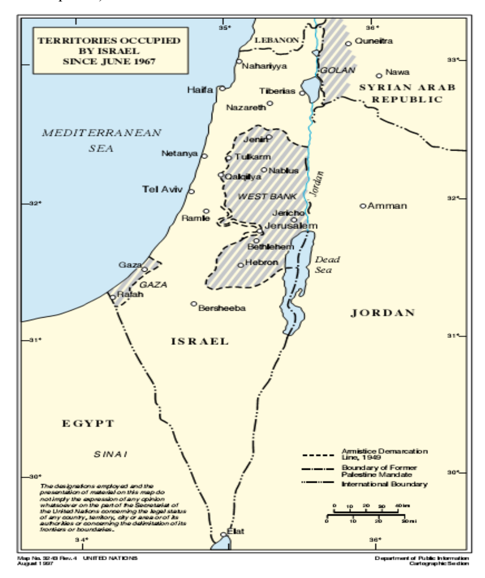
Figure 2: Territories Occupied By Israel since June 1967. (United Nations, 1990. Chapter 3.)

Egypt and Jordan accepted resolution 242 (1967) and considered Israeli withdrawal from all territories occupied in the 1967 war as a precondition to negotiations. Israel, which also accepted the resolution, stated that the questions of withdrawal and refugees could be settled only through direct