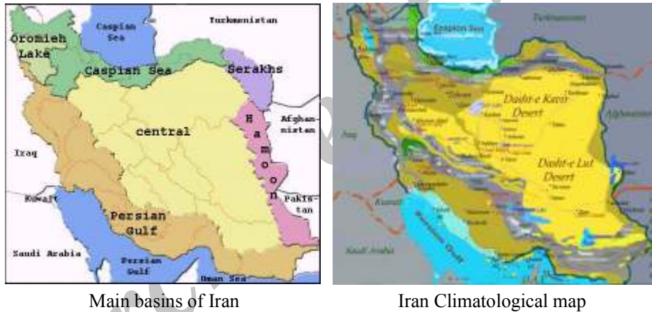
Main basins of Iran