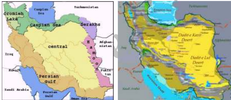
Main basins of Iran