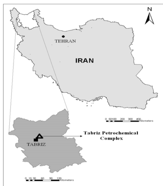
Fig. 1. Location map of Tabriz Petrochemical Complex in Iran

Tabriz petrochemical complex is located in northwest of Iran and west of Tabriz oil refinery. Being located 1362 m above sea level, it occupies 391 ha. Major products of this complex include raw plastics like, polyethylene, polystyrene, ABS, etc. Required raw materials including naphtha and liquid gas are mainly supplied via Tabriz oil refinery. Water supply is provided by east Azerbaijan local water organization, while electricity is produced in-site by means of domestic power plant. Location of Tabriz petrochemical complex in Iran is shown in Fig. 1. The complex consists of different units. A general view of the complex is illustrated in Fig. 1. As it is seen in Fig 2, existing sites may be classified in 5 distinct units; unit one deals with olefin and benzene, unit two 1-butene and polyethylene, unit three resistant, ordinary and expansive polystyrene, unit four ABS and 1-3 butadiene, and finally unit five which consists of services like steam, electricity, recovery and off-site (Abduli, 2005).