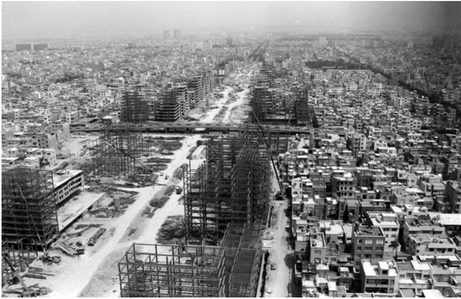
Fig. 3. Navab Project under construction