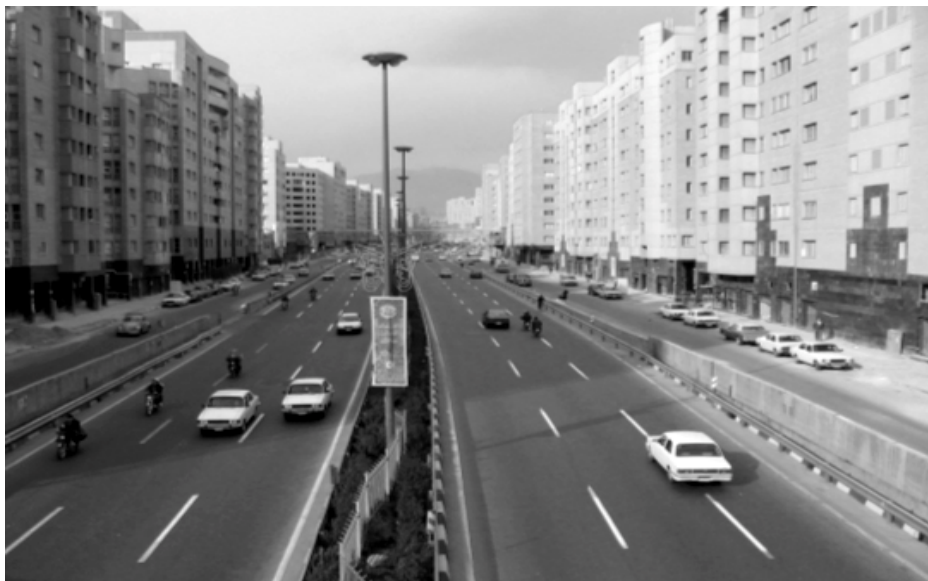
Fig. 4. A view of the built-up corridor of the Navab Project