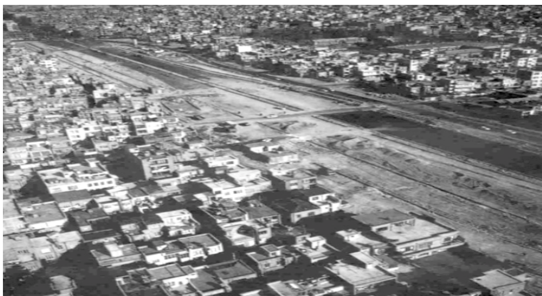
Fig. 2. A view of the demolition site in the Navab Project