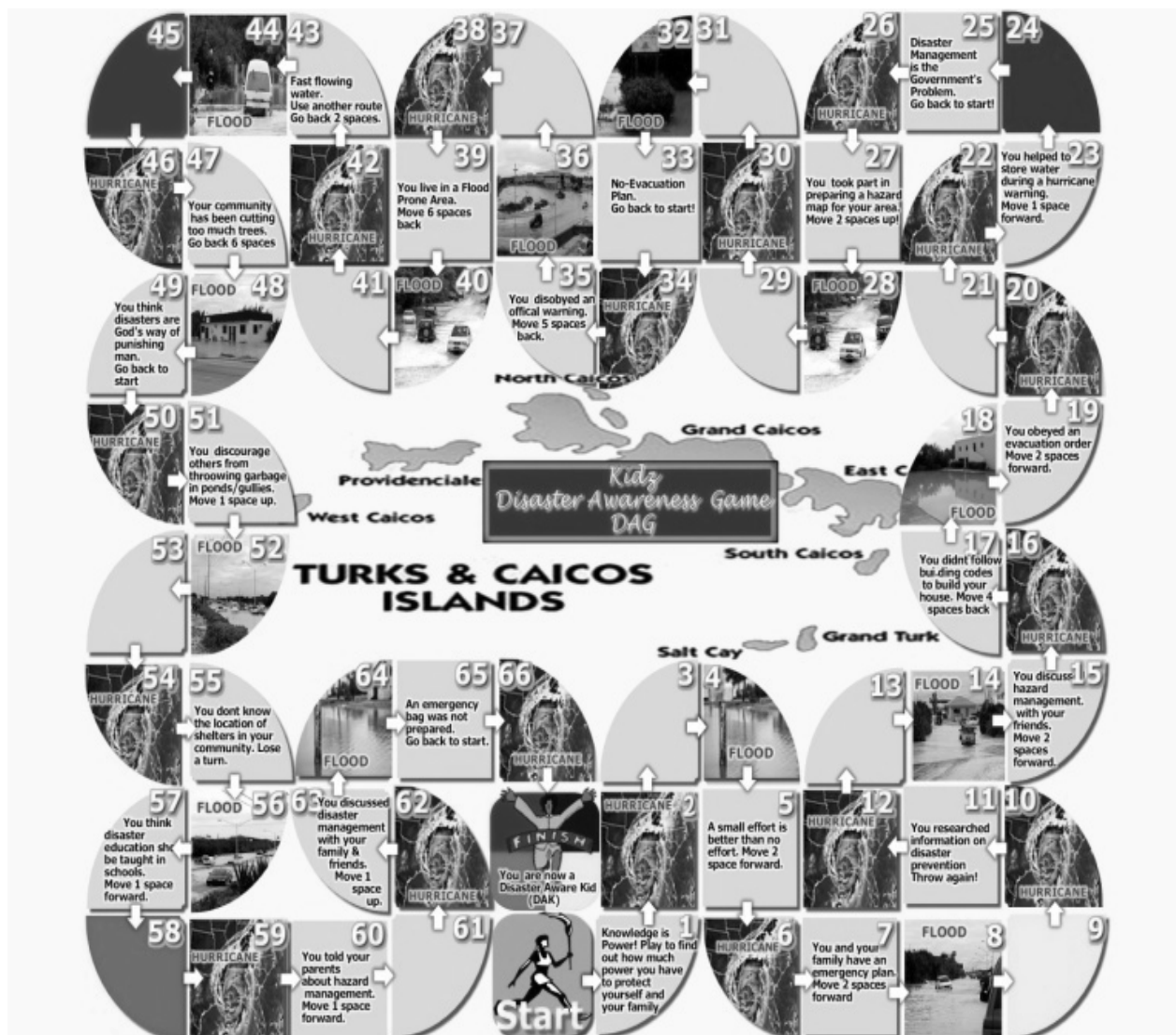
Fig.1. DAG Board-game Component for the TCI

awareness and risk-reduction is its low resource-demand, simple technology and cost effectiveness. The inputs are low cost and easily available so the DAG process can be easily implemented in poor societies where resource availability is a major constraint. Additionally, the digital format of the board game allows facilitators to adapt and modify the game in accordance with the requirements of the local environment in which it is being played. Similarly, the game can be easily modified to concentrate focus on single or multiple hazards as well as on specific components of the disaster management cycle. This level of flexibility can be effective in prioritizing the focus of the disaster management education in schools. In addition, the board game and question cards can