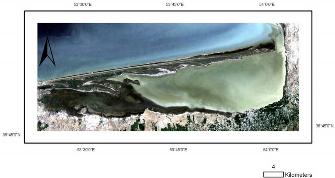
Fig. 1. Location Map of Miankale Peninsula derived from Landsat TM5 scenes of 2010

Land cover maps show spatial distribution of ecological attributes so allowing analyzing ecological process and patterns of biological diversity (Turner et al. , 2003). Analyzing of habitat quantity and configuration in parks and protected areas is thus possible using land cover maps (Parmenter et al. , 2003). For change detection we used visible and (near) infrared bands in Landsat TM5 30m resolution images, recording spectral changes between similar pixels as a surrogate of land cover change. Regarding the main role of time in the perception of environmental changes, time scope of the study is about 25 years from 1985 to 2010. The results constitute a basic requirement for assessing ecological integrity at landscape scale.