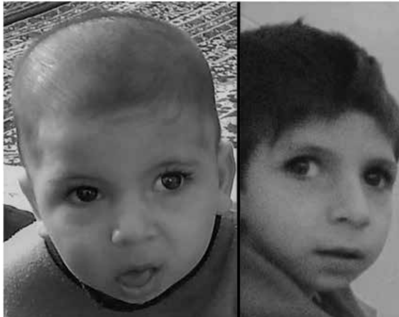
Figure 3. Patient face at 9 months and 7 yr old

analysis for Cockayne syndrome. The patient was homozygous for ECCR6 gene (genotype: c.2551 T>A /p.W851R- c.2551 T>A /p.W851R). The parents were also heterozygous for the same gene. This was also true for the patient's only sister.