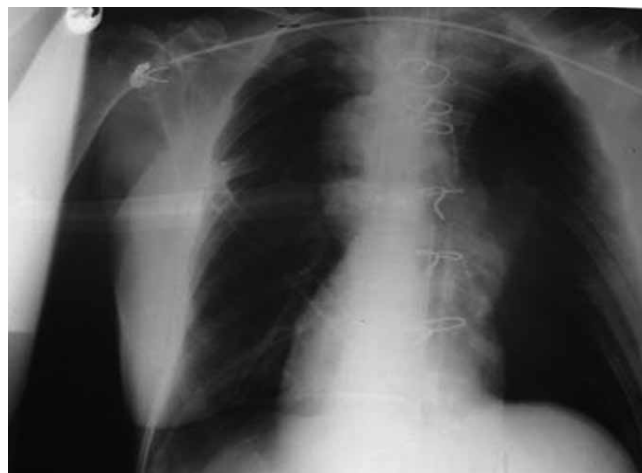
Figure 2. Early postoperative chest X-ray

on the fifth postoperative day (Figure 2). She was on close observation in her follow-up visits without any angina. On multi-slice CT angiography, performed two years later, all of the grafts were patent and perfect (Figure 3).