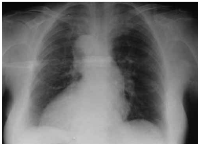
Figure 1. Preoperative chest X-ray, demonstrating dextrocardia as a right sided cardiac shadow

atracurium (0.5 mg/Kg) was used for the induction of anesthesia and tracheal intubation. Afterwards, the central venous line was introduced through the left internal jugular vein in concordance with underlying dextrocardia; however, the patient had a large skin nevus on the left side of the neck and, as a result, a right central venous catheter was inserted.