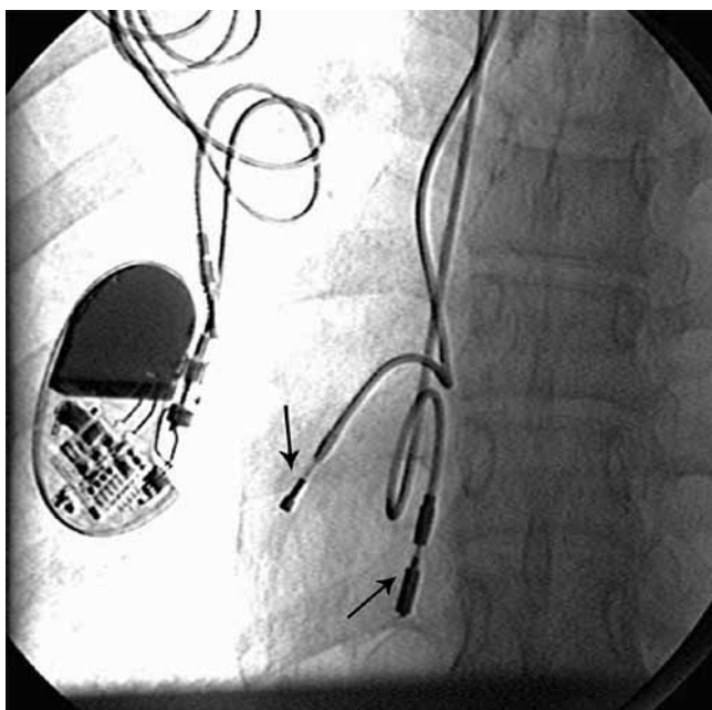
Figure 1. Fluoroscopic anteroposterior view of the chest before the implantation of a cardiac resynchronization therapy device. There is an old single-chamber permanent pacemaker on the right side. The arrow pointing downward shows a lead implanted 14 years previously, and the arrow pointing upward shows a lead implanted 10 years previously. Both leads are in the right ventricle.

On her referral to our center, she underwent echocardiography, which showed moderate to severe systolic dysfunction of the morphological (systemic) right ventricle. Considering the persistence of the symptoms despite medical therapy, decision was made to implant a CRT device in accordance with the new American College of Cardiology/ American Heart Association 2012 guideline, stipulating that patients with severe systemic ventricular systolic dysfunction and ventricular pacing > 40% of the times be upgraded to CRT. 3