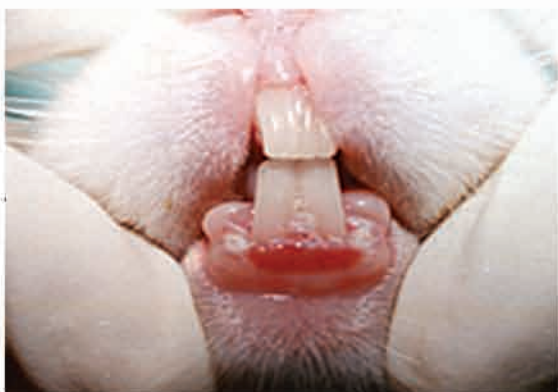
Fig 4- clinical view of flap at time of suture removal (5 days group).