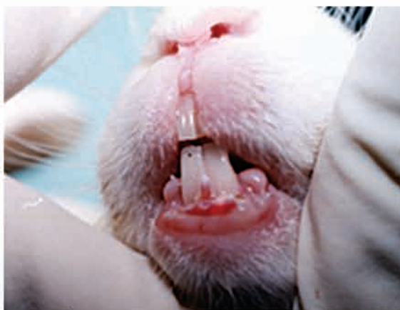
Fig 1- clinical view of flap at time of suture removal (3 days group).