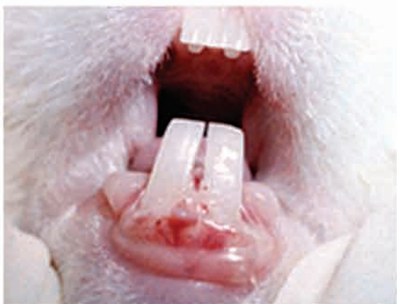
Fig 7- Clinical view of flap at time of suture removal (seven days group).