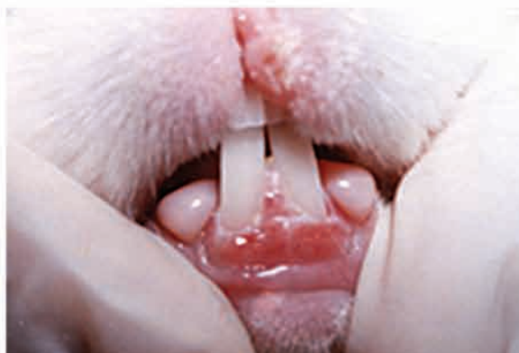
Fig 8- Fourteen days after surgery (seven days group).