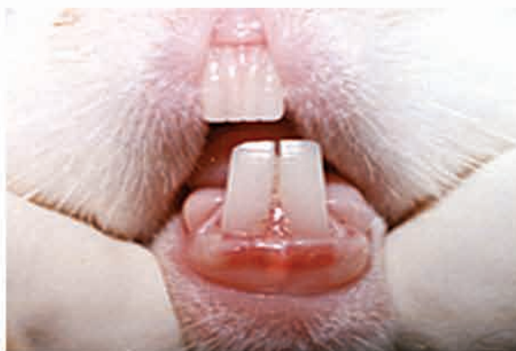
Fig 5- Seven days after surgery (5 days group).