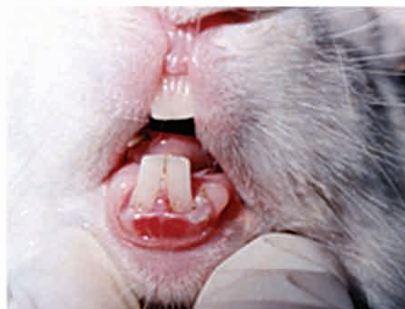
Fig 2- Seven days after surgery (3 days group).