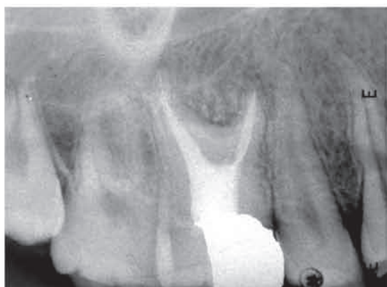
Fig 4- Radiographic image of the tooth one year after a complete root canal therapy

radiograph, both mandibular first molars had normal root configuration (Figure 1).