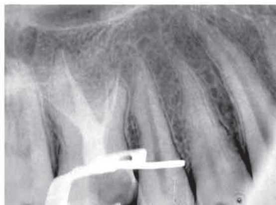
Fig 3- Periapical radiographic images immediately after root canals obturation

radiograph, both mandibular first molars had normal root configuration (Figure 1).