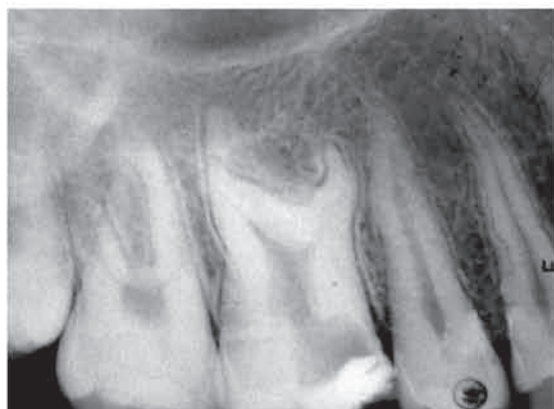
Fig 2- Periapical radiographic images of right maxillary first molar