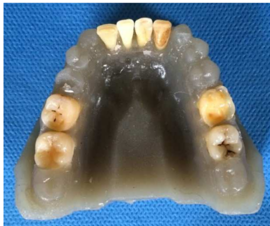
Figure 1. Agar model of mandible for CBCT evaluation

(micro-CT) [22-24] have been used. The most frequently used in vivo methods among the abovementioned techniques are periapical radiography and CBCT. Periapical radiographs can be misleading for the assessment of root anatomy due to the superimposition of the roots or their surrounding structures [1]. In contrast, numerous studies have used CBCT as an accurate method for evaluating the root canal system [25-27].