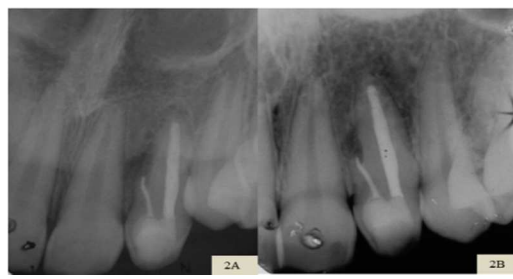
Figure 2. A) Periapical follow-up radiography after 1 year of endodontic treatment; demonstrating a decrease in periapical lesion; B) After 3 years; exhibiting bone neoformation

A 13-year-old female patient was referred to the endodontic clinic of Centro de Pós Graduação em Odontologia - CPO (Post-Graduation Center in Dentistry) in Recife, PE, Brazil, for endodontic evaluation of tooth 22. During the anamnesis, trauma was reported 3 years earlier. The patient reported that she had undergone parentodontic surgery 6 months earlier and a fistula appeared 1 month after the treatment. Antibiotic medication was prescribed, but according to the patient, fistula episodes were recurrent. The physical examination revealed an active fistula in the vestibular region of tooth 22, pain at vertical percussion and palpation, and absence of symptomatology to the cold thermal stimulus (Endo-ice, Hygenic Corp., Akron, OH, USA). From the periapical and occlusal radiography, we verified the presence of dens invaginatus associated with a lateral bone resorption (Figures 1A and 1B). Fistula tracking was performed and involvement of the evaluated tooth was confirmed. Chronic apical abscess was diagnosed therefore; a conservative endodontic treatment was opted for.