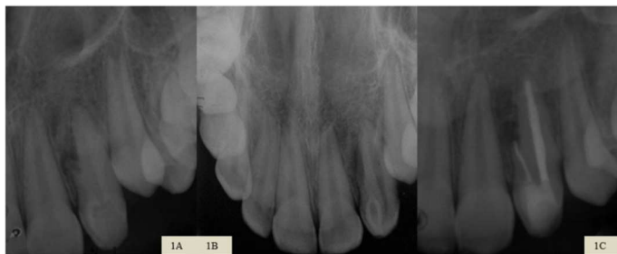
Figure 1. A) Initial periapical radiography; B) Initial occlusal radiograph for verification of dens invaginatus in tooth 22 associated with lateral bone resorption; C) Final periapical radiography with root canal filling and restoration in tooth 22

The main consequence of dens invaginatus is the largest accumulation of debris, which can end in a rapid onset and progression of dental caries, with subsequent involvement of the pulp, resulting in pulp/periapical pathology.