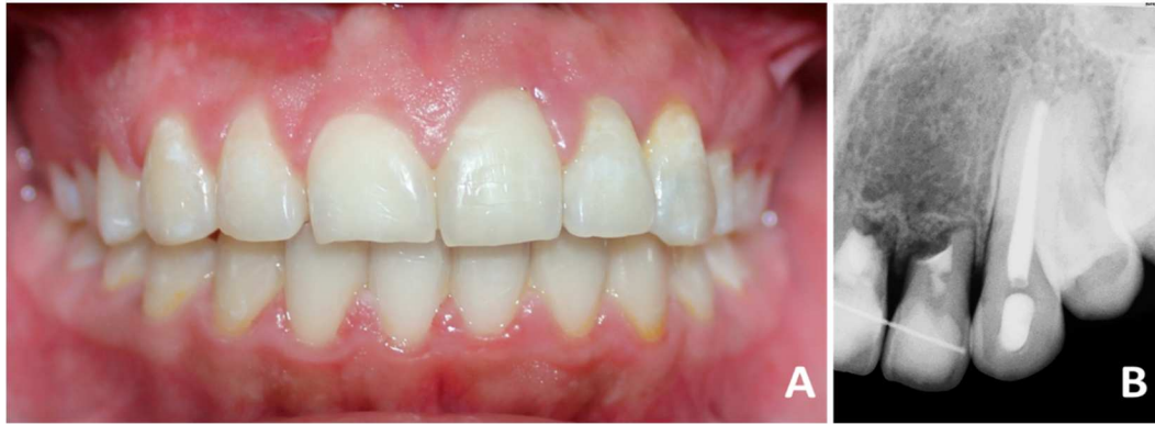
Figure 3. Braces removal and clinical-radiographic control after 2 years of surgical repositioning

performed, and they were filled with Super-EBA cement, placing hydroxyapatite graft (Osteograft, CeraMed Dental, LLC, Lakewood, USA), which was confirmed with a periapical radiograph. It was sutured with Vicryl 3-0 and the same postoperative protocol was followed.