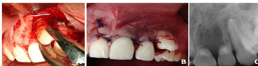
Figure 2. Extraction, autotransplantation of canine and apical filling of incisors