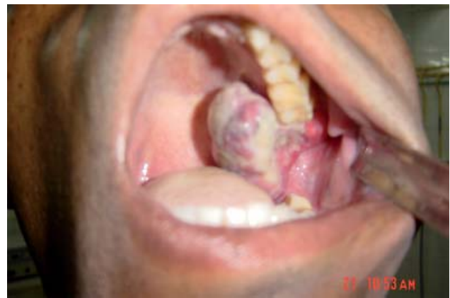
Fig. 1: Intraoral picture showing a lobulated swelling extending from left second premolar region to the soft palate.