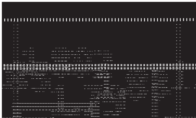
Fig.1: Average of PSA levels of the samples after 3, 6 and 9 hours of sampling of storage in the laboratory at room temperature

The PSA levels of the samples stored in the refrigerator at 4°C were measured after 24, 48, and 72 hours and the average was calculated, which is shown in Fig. 2. The PSA levels of the samples stored in the freezer were measured after 30, 60, and 90 days following sampling and the average was calculated, which is presented in Fig. 3.