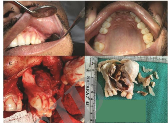
Fig. 2 A,B: Intraoral examination showing swelling over the alveolar mucosa. Buccal cortical expansion was seen extending from left maxillary canine to third molar region. C: Surgical excision of the lesion. D: Excisional biopsy specimen

The Patient gave history of extraction of carious maxillary left first molar associated with