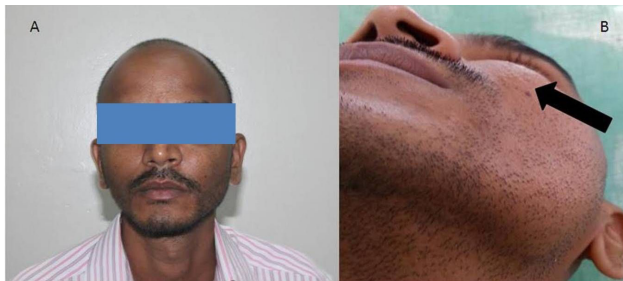
Fig. 1 Patient showing extraoral swelling over the left maxillary area below the infraorbital region

On intraoral examination the swelling was seen over the alveolar mucosa measuring 1x1 cm. Buccal cortical expansion was also seen which extended from left maxillary canine to third molar region and the overlying mucosa