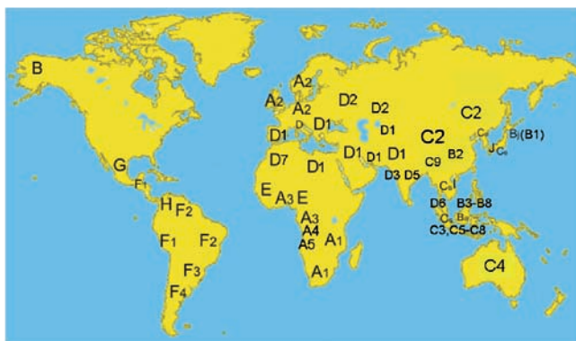
Figure 2. Global distribution of HBV genotypes and subgenotypes. A-J, HBV genotypes A-J; Ba=B2; Bj=B1; Ce=C2; Cs=C1.