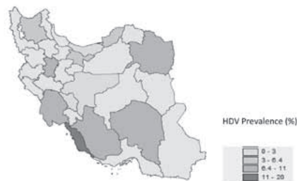
Figure 2. Regional Distribution of Pooled or Individual Prevalence of Hepatitis D Virus Infection Among HBsAg-Positive Patients in Iran, 1983-2008

detect this factor’s impact on HDV prevalence. However, other factors, such as a greater possibility of multiple partners, intravenous drug abuse, war injury, and a higher rate of HBV infection in men (9), can be explained as possible causes of this divergence. The results of this study showed that the main routes of transmission for HDV are blood and blood products; therefore, individuals with a history of transfusion, surgery, tattooing, war injury, dentistry interventions, endoscopy, hemodialysis, intravenous drug use, and patients with coagulation factor disorder are at risk of HDV. This route of transmission is more similar to Western Europe and United States (55). The important groups in our review were hemodialysis patients and intravenous drug users. However, this association was not statistically significant, which may be due to the unadjusted ORs to other factors. We did not have enough data to assess interfamilial and sexually transmitted routes. In addition, the trend of the disease in HBeAg-positive patients with hepatitis D has not been well established. Previous articles showed HBeAg-positive rates of 15 to 30% among HDV patients (6). Our findings demonstrate that HDV is more common in patients who are HBeAg positive.