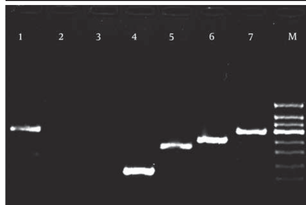
Lane 1 and 7: genotype 4 (288 bp); Lane 2: negative control; Lane 3: nontypeable; Lane 4: genotype 1a (129 bp); Lane 5: genotype 1b (233 bp); Lane 6: genotype 3a (258 bp); M: DNA ladder (50 bp)