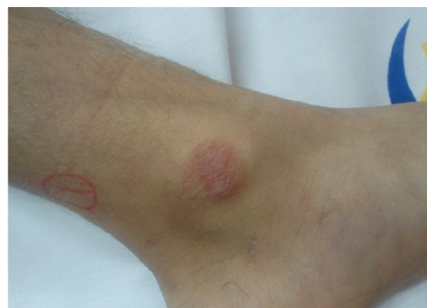
Figure 1. The Skin Lesions Were Present on Both the Legs and Were Tender, Erythematous, and Predominantly Nodular in Shape, Without Any Discharge (Before Treatment)

The results of the laboratory tests were as follows: WBC count, 4,500 \times 10^6 / lit (neutrophils: 39%, lymphocytes: 55%, and others: 6%); hypochromic microcytic anemia (hemoglobin: 10.3 g/dL, MCV: 71); platelets, 174,000/ \mu L; erythrocyte sedimentation rate, 24; creatinine level, 0.9 mg/dL; total bilirubin, 1.6 mg/dL and direct bilirubin, 0.4 mg/dL; serum aspartate aminotransferase (AST) level, 348 IU/L (normal level, up to 40 IU/L); alanine aminotransferase (ALT) level, 555 IU/L (normal level, up to 40 IU/L), alkaline phosphatase (ALP) level, 395 IU/L (normal level, up to 1800 IU/L in pediatric patients); and lactate dehydrogenase (LDH) level, 612 IU/L (normal level, up to 450 IU/L). The results of hemostatic screening tests (for the prothrombin time and international normalized ratio) were normal. Serum protein electrophoresis showed total protein level of 6.9 g/dL (normal range, 6.0–8.4 g/dL), albumin level of 3.6 g/dL (normal range, 3.5–5.0 g/dL), and globulin level of 2.97 g/dL (normal range, 2.3–3.5 g/dL). Her blood samples were not positive for HBs antigen,