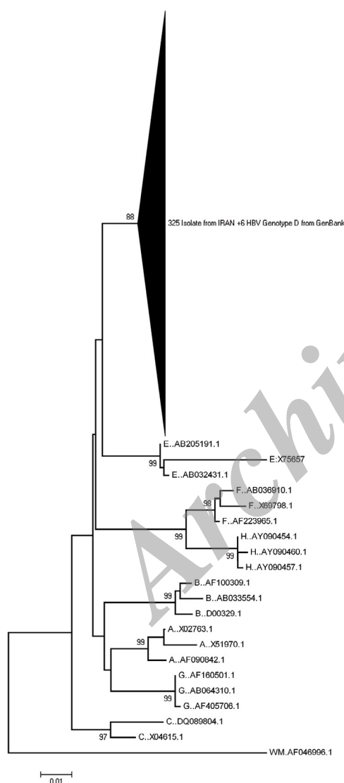
Figure 2. Neighbor joining phylogenetic analysis based on the alignment of the RT gene region (approximately 750-bp) of 325 HBV isolates from Iran as well as other HBV genotypes from Gen Bank as reference. Bootstrap values indicate 1000-fold replicates. Due to clarity, the 325 isolates from Iran and 6 reference genes of HBV genotype D was collapsed. Woolly monkey HBV was used as the out-group sequence.

The phylogenetic tree was constructed using the alignment of HBVRT region of patients (325 isolates from this study) along with different HBV genotype (A to H) sequences retrieved from the Gen Bank as reference genes. The phylogenetic tree revealed that all Iranian isolates were branched with other genotype D of HBV reference isolates with a high boot strap value, 99%, 1000 \times replicates (Figure 2).