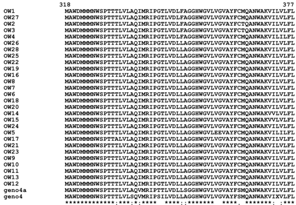
Figure 2. Multiple Alignment for E1/E2 Amino Acid Sequences Means that all the sequences are identical in the alignment. showed the conserved substitutions. "showed the semi-conserved substitutions. The space means that substitutions are observed.