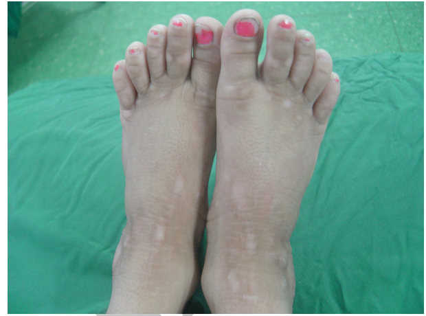
Figure 1. Feet Showing Broad Toe With Grossly Thickened and Lichenified Skin

cefixime was administered for a month. During a 9-month follow-up, she was well, except for a transient self-remitting abdominal colicky pain, and the pruritus was completely relieved. Stool was green and loose and she gained about 4 kg.