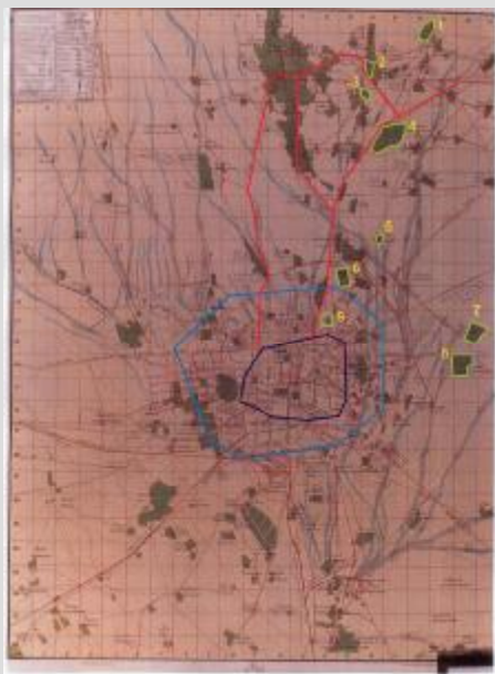
Figure 3-The linking axes of city and surrounding gardens on the mountain foot outside the city enclosure (Map Museum-2001). (The most important Gardens):