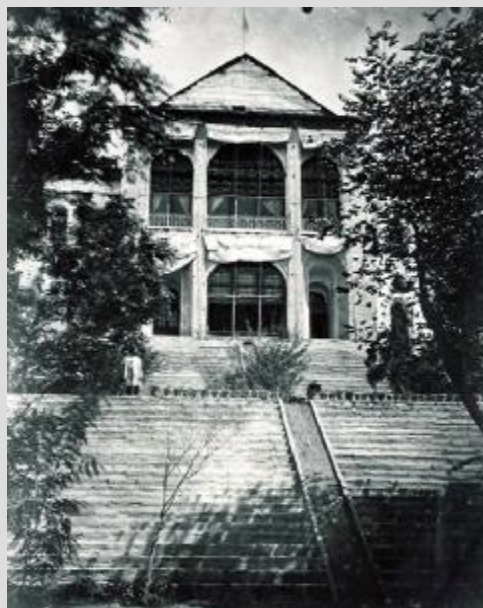
Figure 4-Niavaran Palace in Qajar period

the connection started between them. The choice of Niavaran Garden as a temporary and ceremonial residence by Reza Shah Pahlavi, in the late second half of the 19th century, served a key role in developing the city towards the mountainside and converting the country paths into streets and orientating the city axes as well and one of the access routes to Niavaran Village became a developing axis of the city. In this period, the garden and its system and structure remained intact with no additions. In this era, the garden sustained its order and structure with no further changes. At the time of Mohammad Reza Shah Pahlavi, in the early second half of the 20th century, western modern culture swayed not only architecture but royal lifestyle and garden constructing. In this era, new recreational needs and a completely different way of thinking than that of Qajar era changed the structure