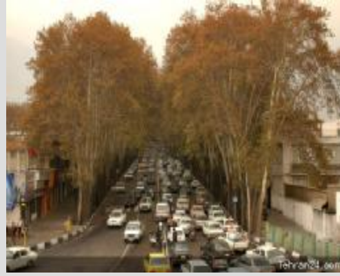
Figure 5- view of development main axis of Tehran toward Shemiran in Pahlavi era-2005

in a row in the Qajar garden, changed so that ornamental trees were planted with a natural order on turfs to create various scenes. Due to the vast area of turfs, open and sunshiny spaces replaced the shadowy spaces of the old trees. In addition, different spaces including relaxing spaces (like bowers), sports fields (like tennis courts), spaces for royal celebrations as well as green houses for growing special plants were added to the garden.