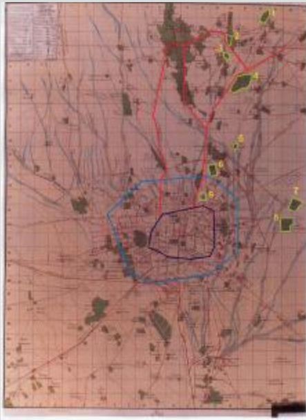
Figure 3-The linking axes of city and surrounding gardens on the mountain foot outside the city enclosure (Map Museum-2001). (The most important Gardens):