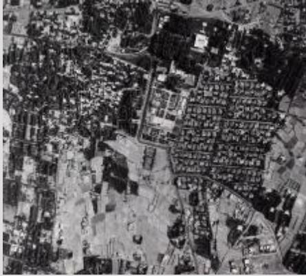
Figure 6- An aerial photograph of Niavaran Palace in Pahlavi period-1969