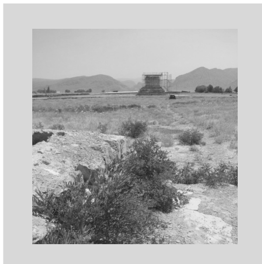
Figures 5 and 6. Parse- Pasargadae historical area.

Since 1960, many Qashqa'i have settled in local villages and towns, although often retaining pastoralism as one of their several means of livelihood. Despite the new places and patterns of residence for many of these settlers, most remained attached to their customary seasonal pastures, visited their kin there, and continued to exploit the resources, often in cooperation with these kin. Their winter and summer pastures are located in the valleys and on the slopes and plateaux of the "High Zagros" mountain. Mountain peaks rise above the nomads' camps, each of which is usually secluded by the rugged terrain. A typical campsite in winter pastures would contain three woven goat-hair tents with slanted roots to deflect rain and snow. The black tents were pitched on flat areas on the slopes of gullies to protect the