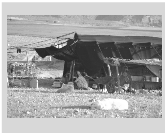
Figure 7. A typical campsite in winter pastures contained three woven goat-hair tents with slanted roots to deflect rain and snow.

occupants and their possessions from flash floods while also still providing some shelter from wind (Beck, 2001) (Figure 7).