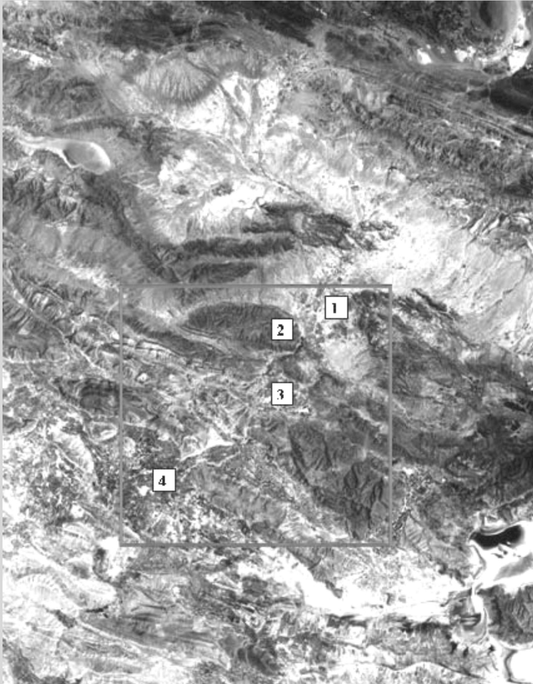
Figure 2. Satellite image of Zagros folded range.

Legend: 1- Pasargadae; 2- Tang-eBolaghi valley; 3- Plains; and 4- Parse.