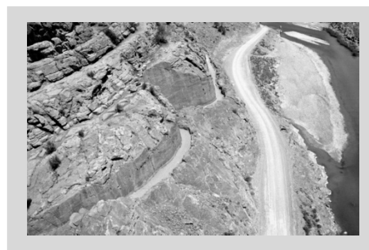
Figure 4. Polvar-Sivand River in Tang-e Bolaghi valley (southern part of Marghab plain).

Historically speaking, the signs of civilization in this region date back to Neolithic and cave-dwelling periods. The signs and remains of primitive human communities in caves and stone crevices in deep valleys besides the Polvar-Sivand River have been found, especially in southern part of Marghab plain, also called Tang-e Bolaghi valley (Figure 4).