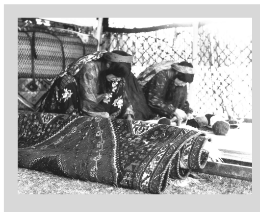
Figures 8 and 9. Qashqa'i pastoralists' handicrafts include symbols and pictures of their migratory life style.

Their handicrafts usually include symbols and pictures of their migratory life style and are woven in naturally dyed yarn with abstract forms of flowers, trees, mountains, plains, valleys, waters and animals. In these woven handicrafts the culture, emotions, fear of natural forces, sacredness of mountain and water and even picture of ancient works are woven in the form of "memory art".