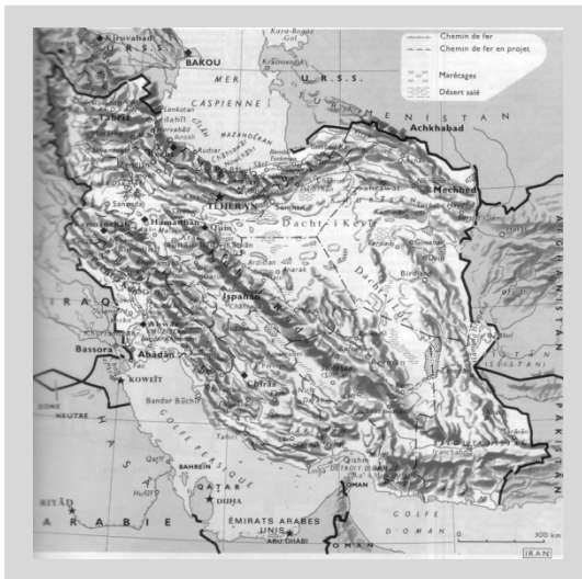
Figure 1- Map of Iran (Larousse, 1986)

Iran is a mountainous territory formed during the Tertiary-Quaternary period by Alpine orogeny. Through the collision of the Neotethys, an ocean lying between Eurasia, and Gondwanaland (Afro-Arabia) a large bowl-shaped continental plateau has been formed. Although this plateau is a high land with several mountain ranges, and hinterland plays and lakes, its marginal zones (Alborz and Zagros) are much higher where they surround a vast territory with Isberg-type peaks and wide plains forming upper-lower correlated systems (Figure1) (Kinsely, 1970).