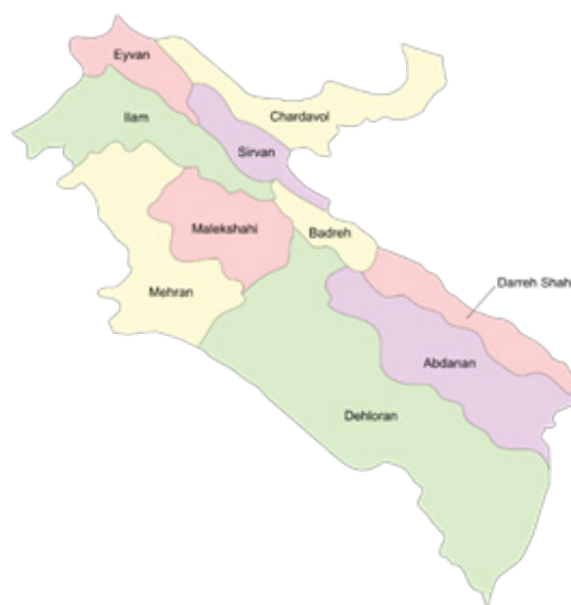
Fig. 1- Geographical map of Ilam province, Iran

ber 2014; of which 150200 and 62475 hectares were respectively allocated to the cultivation of wheat and barley (Iran Statistical Yearbooks, 2017).