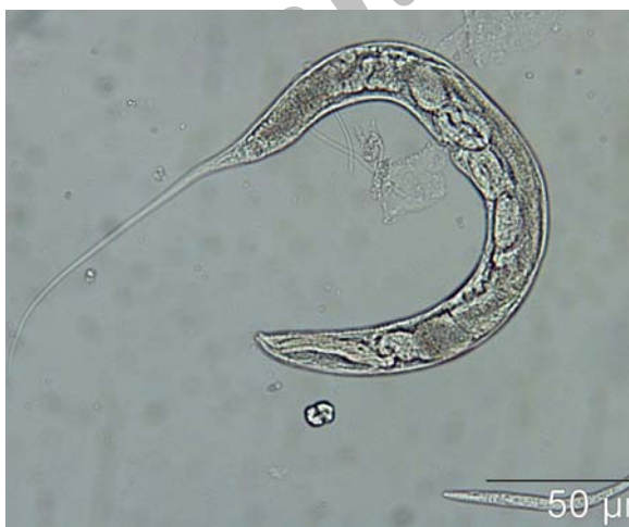
Fig. 1: Female of Rhabditis axei (400×)

**** There were 6 cases of coinfection with parasites.