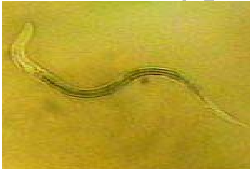
Fig. 1: Filariform larva of Strongyloides stercoralis on the surface of agar plate