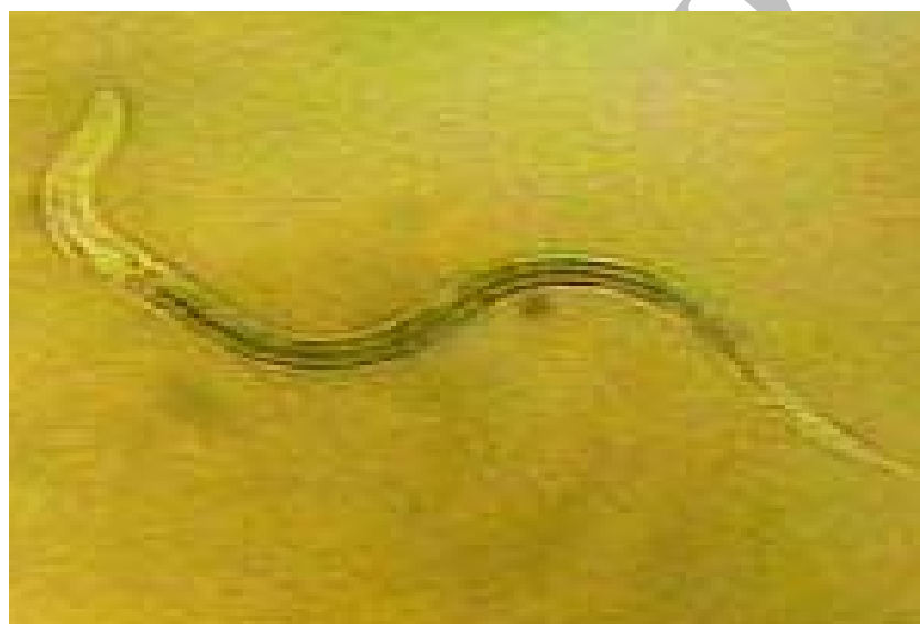
Fig. 1: Filariform larva of Strongyloides stercoralis on the surface of agar plate