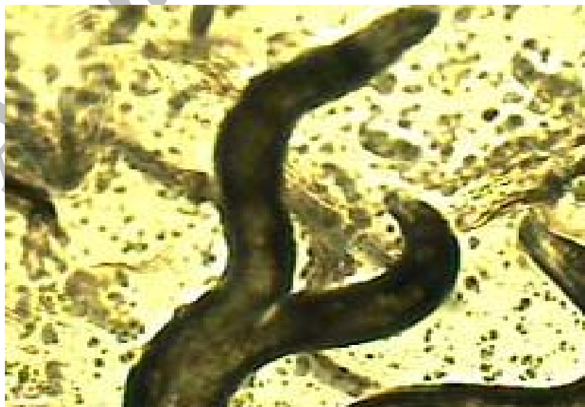
Fig. 2: A view of agar plate showing free living adults and larvae of Strongyloides stercoralis