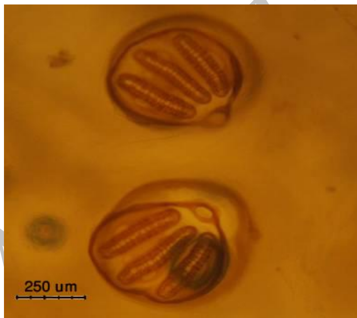
Fig. 2: The posterior spiracle of Lucilia sericata instar