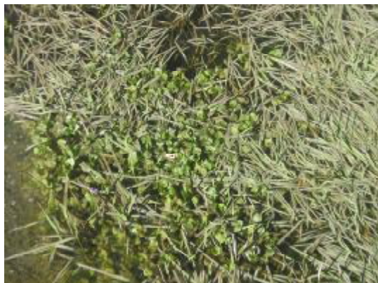
Fig. 2: Wild freshwater plant Nasturtium microphyllum (Local name Bakaloo) commonly used in Yasuj district