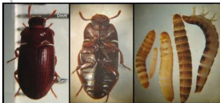
Fig. 1: Dorsal, ventral surfaces of adult (left) and some larval stages (right) of Alphitobius diaperinus collected from the pigeon houses in Ahvaz City, Khuzestan Province, Iran

All of the collected beetles from the pigeon house were identified as Alphitobius diaperinus (Fig.1), due to the characteristics of adults, described by Dunford et al. 2004, 2009. Adult beetles are broadly oval, moderately convex, black or brownish-black in color and usually shiny in appearance. Color can be variable depending on the age and size. Antennae are densely clothed with short yellowish hairs, with the terminal segment lighter in color. The head is deeply emarginated in front, has a distinct clypeal groove, and the surface is coarsely punctured. Eyes are emarginated approximately one-half the length of eye, and prosternal process is horizontal between forecoxae (23, 24). Average length and width of the collected adult beetles were 6.31 mm (5.54 to 6.96mm) and 2.88 mm (2.50 to 3.20 mm) respectively. The number and percentage of infected adult beetles, their nematode burden and type of larvae (free or cystic forms) (Fig. 2) are summarized in Table 1.