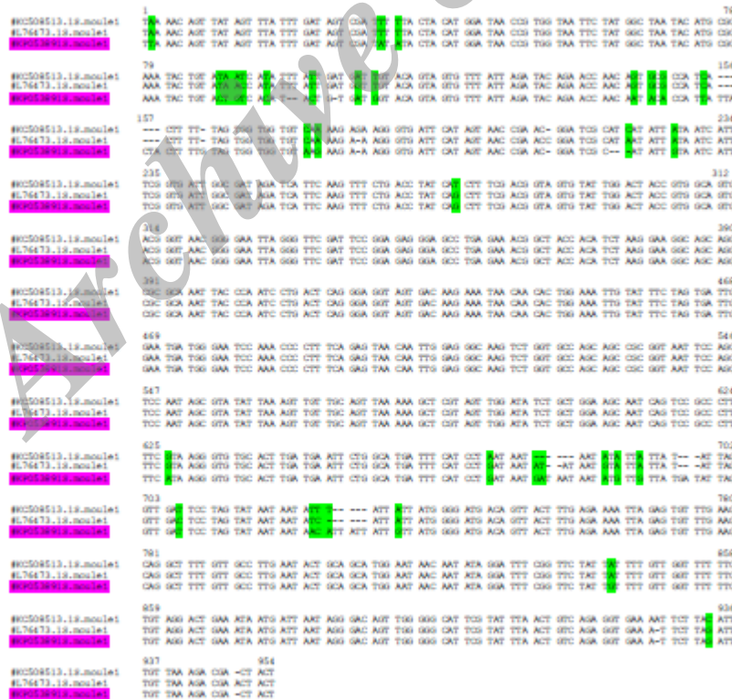
Fig. 2: Multiple sequence alignment of the partial 18S rRNA gene derived from the comparative analysis of the Iranian S. moulei isolated from slaughtered sheep and previously S. moulei strains deposited in GenBank

Thirty PCR products of the 18S rRNA gene were successfully sequenced. Each PCR product yielded a fragment containing 850 to 1021 consensus nucleotides. Overall, 20 out of 30 samples (66.7%) and six/thirty (20%) isolates had a similarity of more than 98% and 100% coverage to S. gigantea accession number KC209733 or L24384 and S. moulei accession number L76473 or KC 508513, respectively (NCBI GenBank). 13.3% isolates showed a similarity of more than 89% and 50% coverage to Sarcocystis spp. accession number GQ131808. Multiple alignments showed some variation in the consensus sequences of the isolates obtained in the current study compared with previously published S. gigantea isolates and with each other (Fig. 2). The same results were observed for S. moulei (Fig. 2). A phylogenetic tree of three S. gigantea , two S. moulei and some published sequences (NCBI GenBank) is shown in Fig. 3.