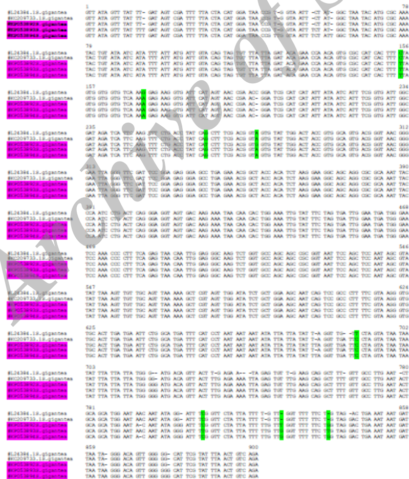
Fig. 1: Multiple sequence alignment of the partial 18S rRNA gene derived from the comparative analysis of the Iranian S. gigantea isolated from slaughtered sheep and previously S. gigantea strains deposited in GenBank

The partial sequence of the 18S rRNA gene of three S. gigantea and one S. moulei isolates have been deposited in the NCBI database under the accession no. KP053892, KP053893, and KP053894 and KP053891, respectively.