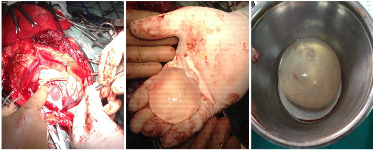
Fig. 2: Surgical excision of the brain hydatid cyst via right craniotomy through parietal bone