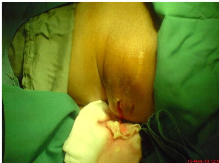
Fig. 3: Washing the cavity by silver nitrate and drainage of the liquid from that (Original)