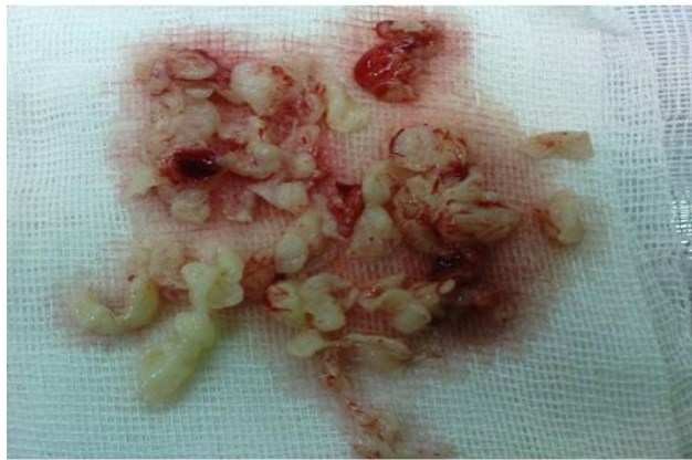
Fig. 1: Fragmented tissues evacuated from the cyst (Original)

In physical examination, a midline laparotomy scar from previous surgery was observed. In addition, it was revealed a tender, fluctuated cystic swelling fixed to left gluteal muscle with evidence of local inflammation. This was followed by surgical drainage of the mass. The patient was operated under a spinal anesthesia. A primary differential diagnosis of gluteal abscess was considered, but after surgical incision, a turbid liquid containing yellow fragmented tissues leaked from the cyst leads to diagnosis of hydatid cyst (Fig. 1, 2).