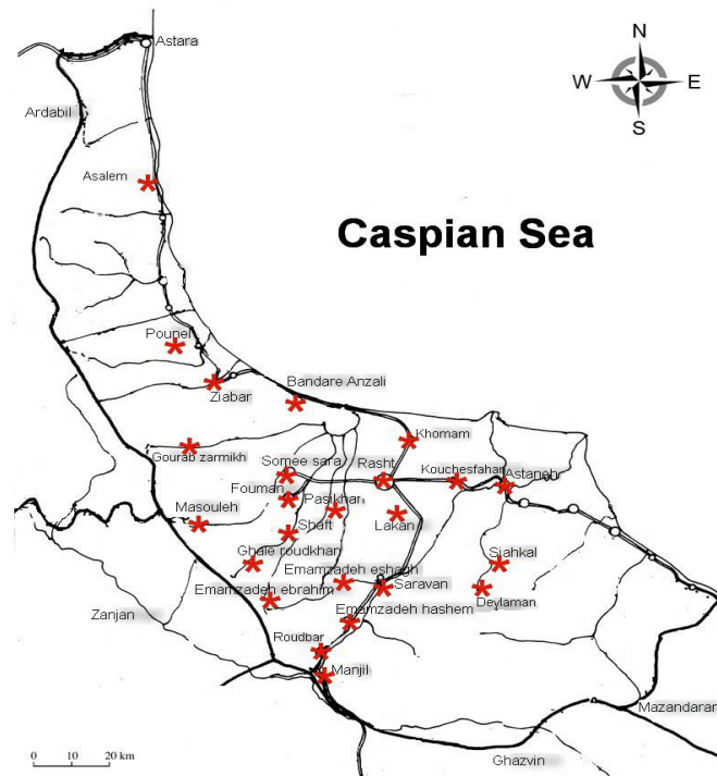
Fig. 1: The collecting locations of road killed carcasses in Guilan Province

Recovered helminthes were stored in 70-degree ethanol while the specimen condition aiming to morphological identification such as body relaxation and flattening were done for cestodes, specifically. For tapeworms, carmine acid staining, and for transparency of nematodes lachtophenol solution were used. Classical identification for the helminthes has been finalized by the use of reliable key references (11-13).