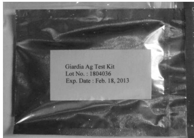
Fig. 2: A commercially available immunochromatographic antigen test kit (ImmunoRun® Antigen Detection Kit- BioGal-Labs, Israel) specifically used for the detection of Giardia duodenalis antigen from fecal samples.

The rest of the fresh and unpreserved fecal samples were further tested using ImmunoRun® Antigen Detection Kit: Giardia (Fig. 2) to confirm the results of the Modified-Flotation method previously performed.