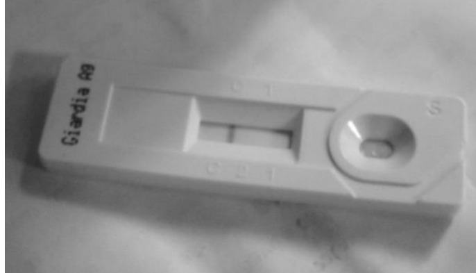
Fig. 4: ImmunoRun® Antigen Detection Kit showing negative results as indicated by the single bar that indicated the positive control of the detection kit

samples, for both sampling dates, were negative for G. duodenalis antigen (Fig. 4)