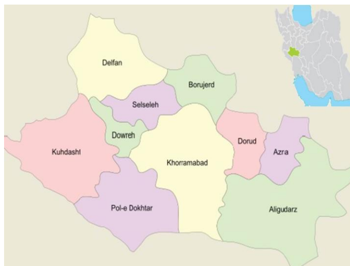
Fig. 1: Location of Lorestan Province in Iran

The samples were collected in accordance with the population of each city. Based on a random sampling, people were asked to present in health centers for collecting sera. Each patient filled a questionnaire including information on food diet, vegetable consumption, travelling to northern Iran, clinical symptoms etc.