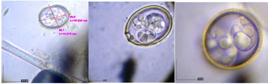
Fig. 3: The identified Coccidial species by using a Dino-Lite USB microscope. A: Tyzzeria spp. B: W. philiplevinei C: I. mandari (Original figure)