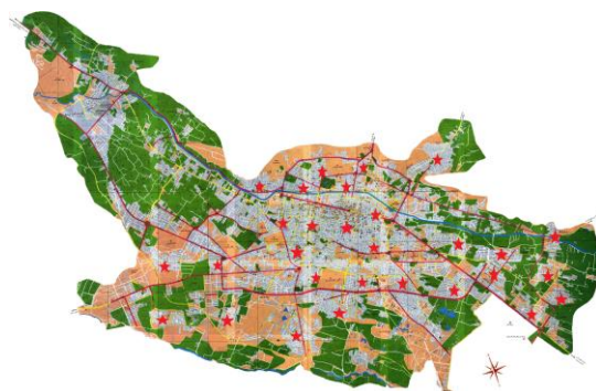
Fig. 1: A) Map of Iran, showing the location of Shiraz in Fars province, Iran B) Map of Shiraz city with stars indicating capture areas for stray cats tested for T. gondii in the study

The welfare of an animal includes its physical and mental state and we consider that good animal welfare implies both fitness and a sense of well-being. An animal's welfare, whether on farm, in transit, at market or at a place of slaughter should be considered in terms of "Five Freedoms": 1- Freedom from Hunger and Thirst, 2- Freedom from Discomfort, 3- Freedom from Pain, Injury or Disease, 4- Freedom to Express Normal Behavior, 5- Freedom from Fear and Distress.