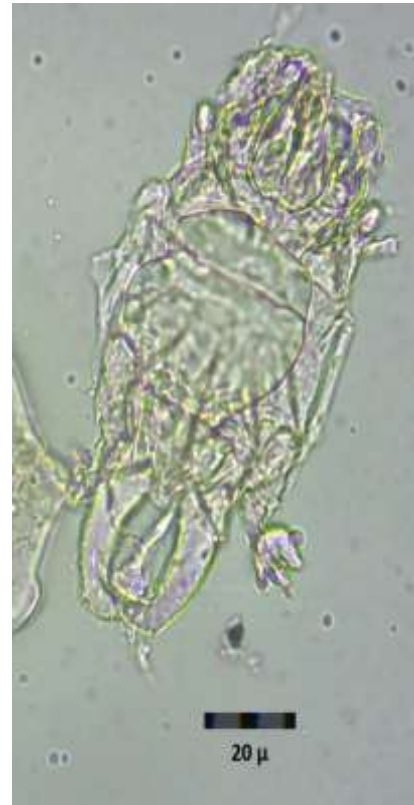
Fig. 2: The mite in herbivores coprolites recovered in Chehrabad Archeological Site, Zanjan, Iran.