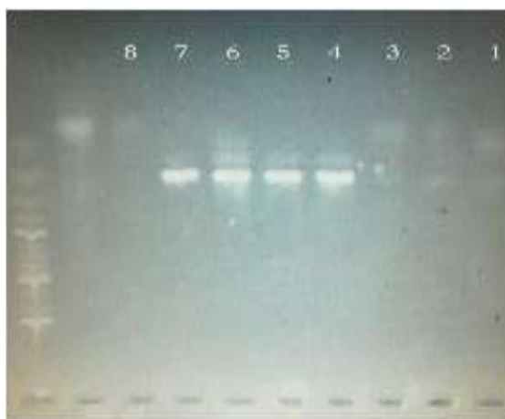
Figure 3. wetA gene in dermatophytes

1: E. floccosum , 2: M. ferrugineum MH383042, 3: T. interdigitale , 4: M. ferrugineum MH383043, 5: M. canis MH383044, 6: M. canis MH383045, 7: M. canis MH383046, 8: negative sample