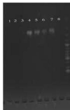
Figure 1. brlA gene in dermatophytes

1: E. floccosum , 2: M. ferrugineum MH383042, 3: T. interdigitale , 4: M. ferrugineum MH383043, 5: M. canis MH383044, 6: M. canis MH383045, 7: M. canis MH383046, 8: negative sample