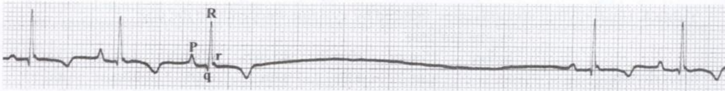
Fig 1. Sinus arrest accompanied by first-degree AV block in a dog, 15 minutes after induction of anesthesia with a ketamine-xylazine combination (Lead II; 25 mm/sec., 10 mm = 1 mV).