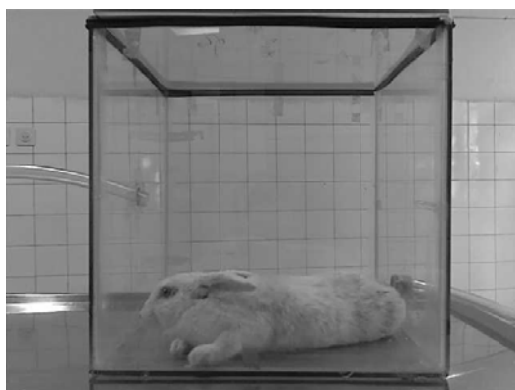
Figure 1. 40 cm 3 homemade chamber designed by the authors for isoflurane anesthesia.

Induction time of anesthesia and recovery along with duration of apnea and volume of delivered gas used for induction were recorded in all animals in both groups. They were monitored intensively for any signs of complications during induction of anesthesia, operation and recovery were recorded.