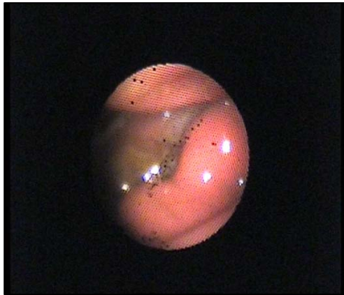
Figure 3. Normal appearance of the anastomotic site.

was observed in the remained part of stomach close to gastrojejunal anastomotic site in one patient in group A (Fig. 5). Also regurgitation was noticed in the same patient. A 1 cm to 1 cm ulcer was reported in one patient in group B (Fig. 6). Morphology of all sites of anastomosis was normal. They were all patent and healed normally without any signs of inflammation.