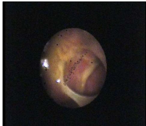
Figure 5. Ulcerative mass in stomach.