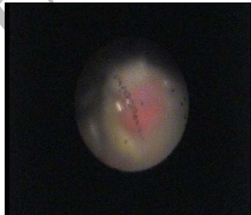
Figure 6. Ulcer noticed in the stomach.