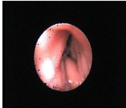
Figure 4. No evidence of reflux esophagitis.