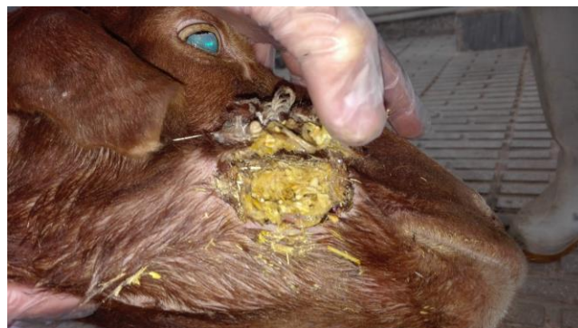
Figure 2. Ewe with buccal food impaction in the right cheek and sign of partially cheek necrosis due to unprofessional suture by the sheep owner.